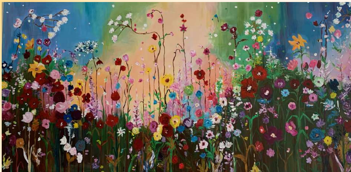
By Seema Agrawal (2021) Title: Spring